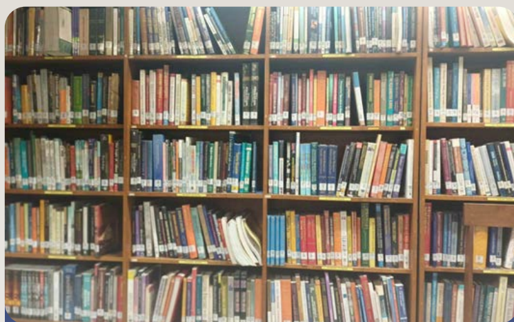
JRU Graduate School library, my home for 2 ½ years