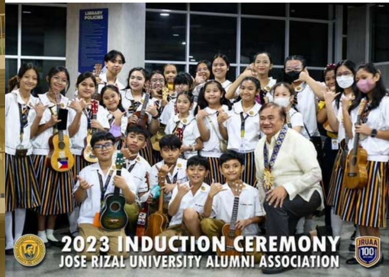
Young Rizalian Ukulele and Ensemble