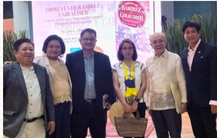
Alumnus Launches Latest Book