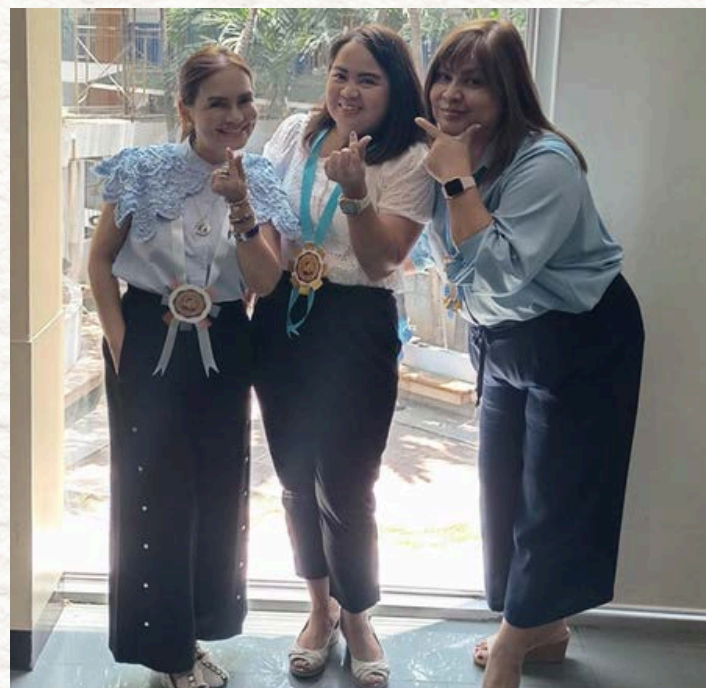
ADO Invites Alumni as Judges for CSE